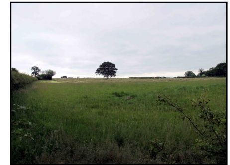
View from Green Lane - looking South

sufficient land for development to comply with The Plan for Stafford Borough.