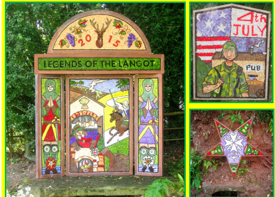
CROXTON WELL DRESSING - JULY 4TH, 2015